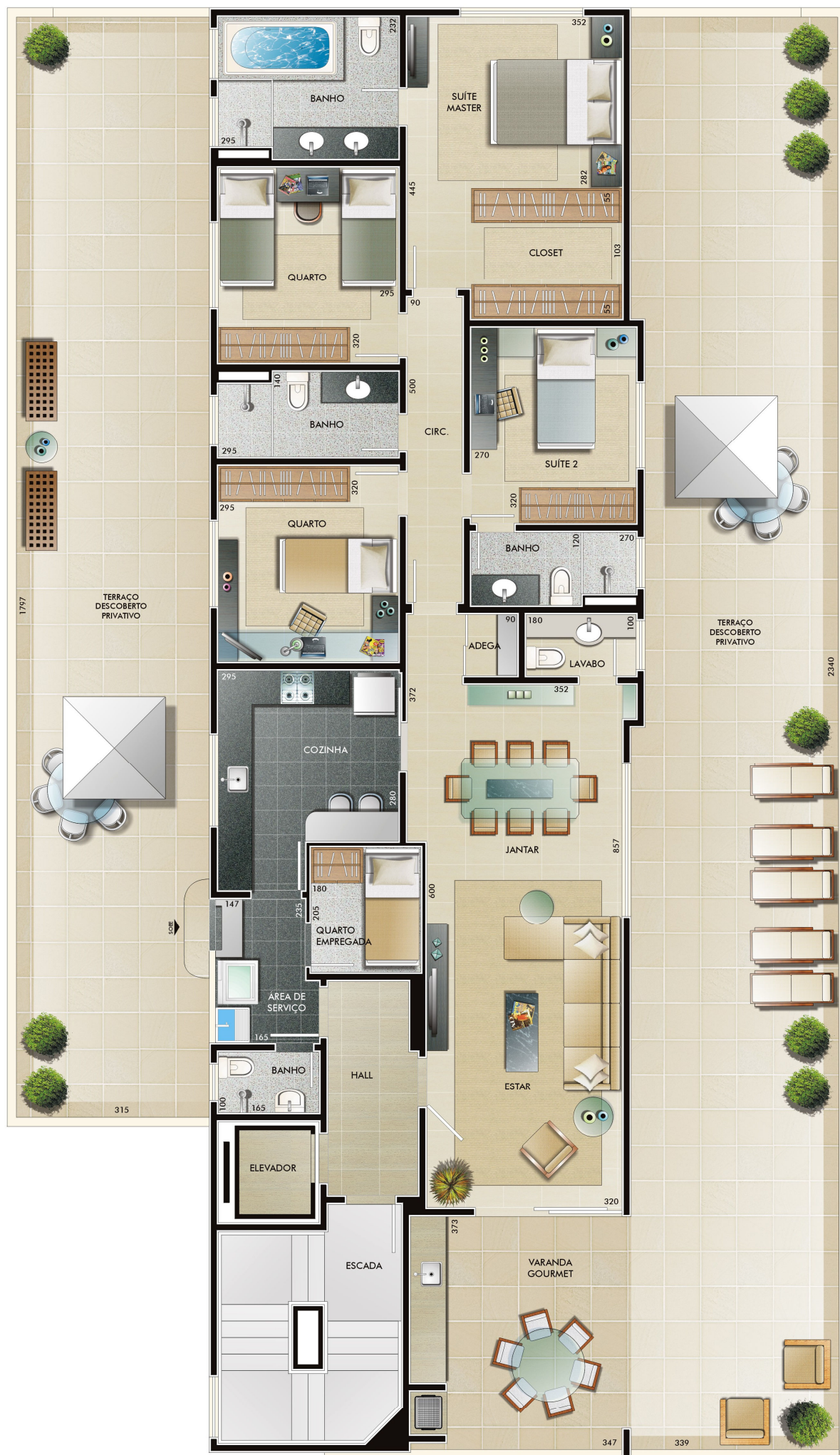
PLANTA APARTAMENTO 201