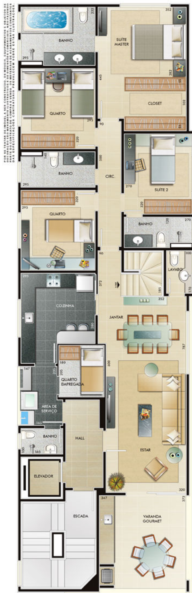
PLANTA APTO. COBERTURA 701 NÍVEL 1