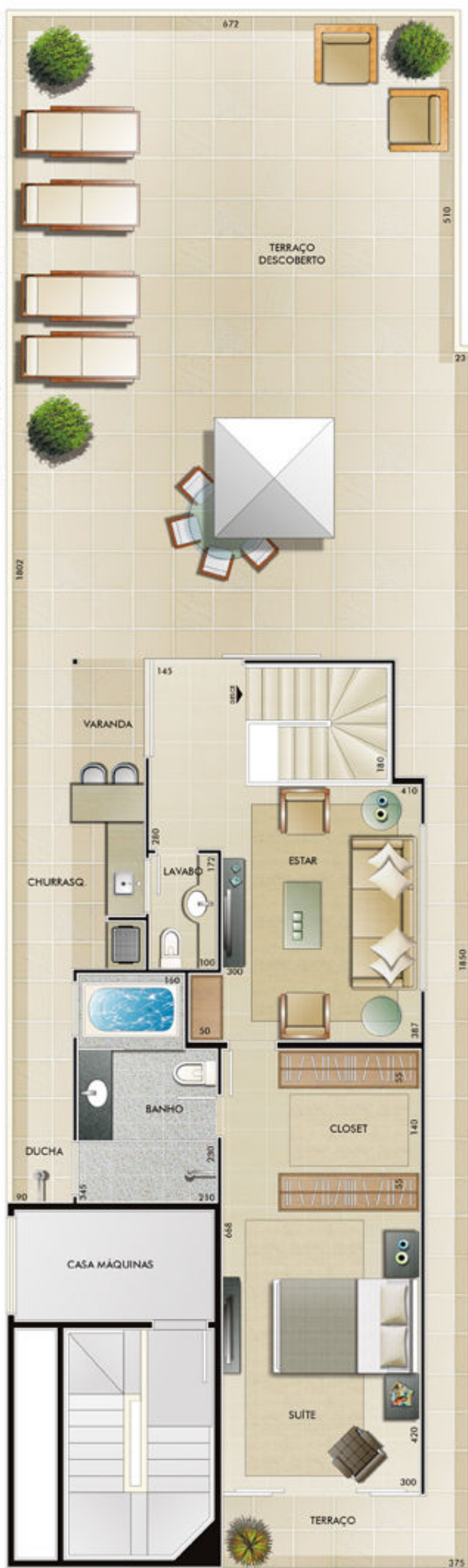
PLANTA APARTAMENTO 701 NÍVEL 2

POR SE TRATAR DE IMÓVEL A SER CONSTRUÍDO, OS MÓVEIS, EQUIPAMENTOS E OBJETOS DE DECORAÇÃO SÃO APENAS REPRESENTAÇÕES GRÁFICAS, NÃO SE ENCONTRANDO NA PARTE DO CONTRATO DE COMPRA E VENDA. OS MATERIAIS DE ACABAMENTOS CONSTANTES DAS ESPECIFICAÇÕES CONTRATUAIS PREVALECEM SOBRE ESTAS ILUSTRAÇÕES.