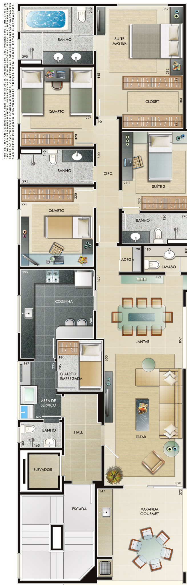
PLANTA APARTAMENTO TIPO