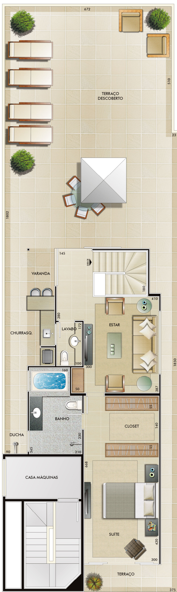
PLANTA APARTAMENTO 701 NÍVEL 2

POR SE TRATAR DE IMÓVEL A SER CONSTRUÍDO, OS MÓVEIS, EQUIPAMENTOS E OBJETOS DE DECORAÇÃO SÃO ILUSTRAÇÕES. A REALIZAÇÃO DE VISITAS E AVALIAÇÃO DE OBRAS DEPARTAM-SE DA RESPONSABILIDADE DO VISITANTE. A REALIZAÇÃO DE VISITAS E AVALIAÇÃO DE OBRAS DEPARTAM-SE DA RESPONSABILIDADE DO VISITANTE. A REALIZAÇÃO DE VISITAS E AVALIAÇÃO DE OBRAS DEPARTAM-SE DA RESPONSABILIDADE DO VISITANTE.